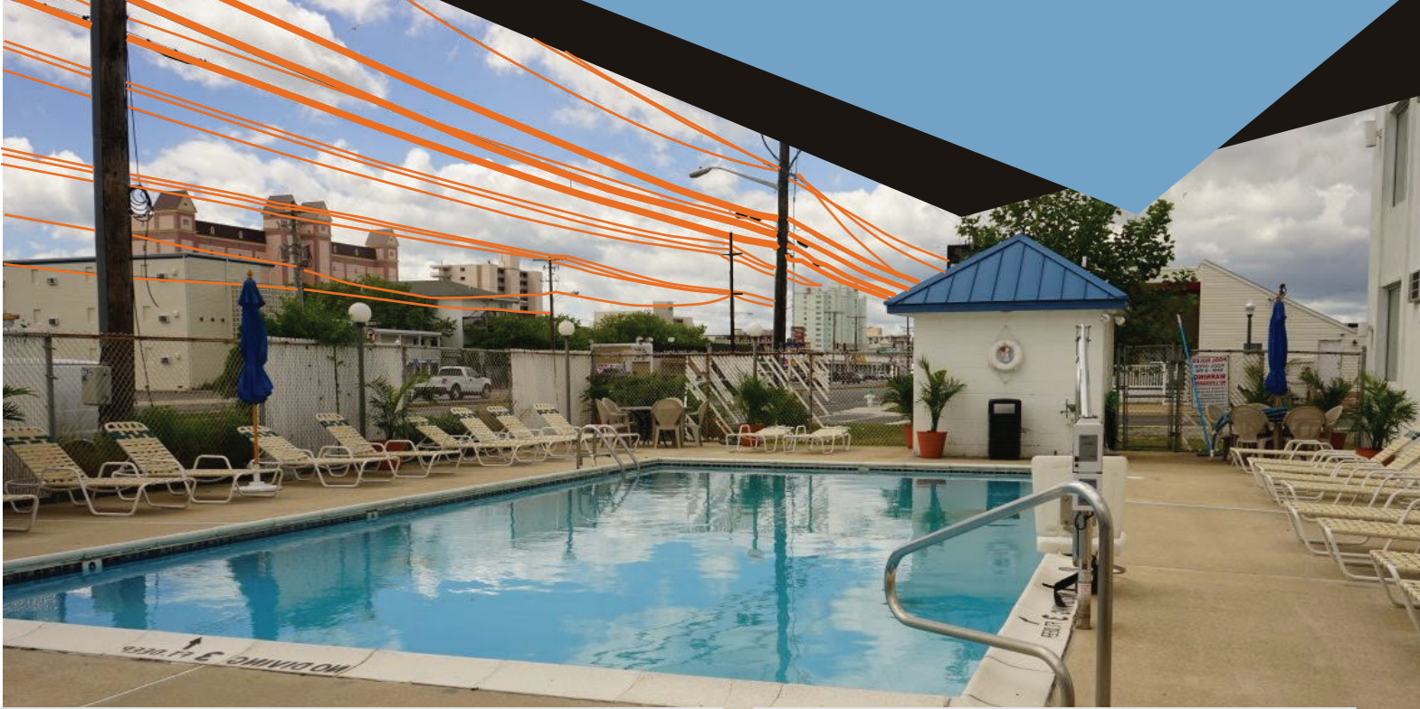
Table 1: OVERHEAD CLEARANCES