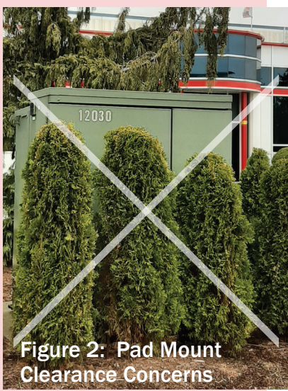
Figure 2: Pad Mount Clearance Concerns