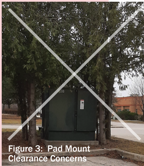
Figure 3: Pad Mount Clearance Concerns